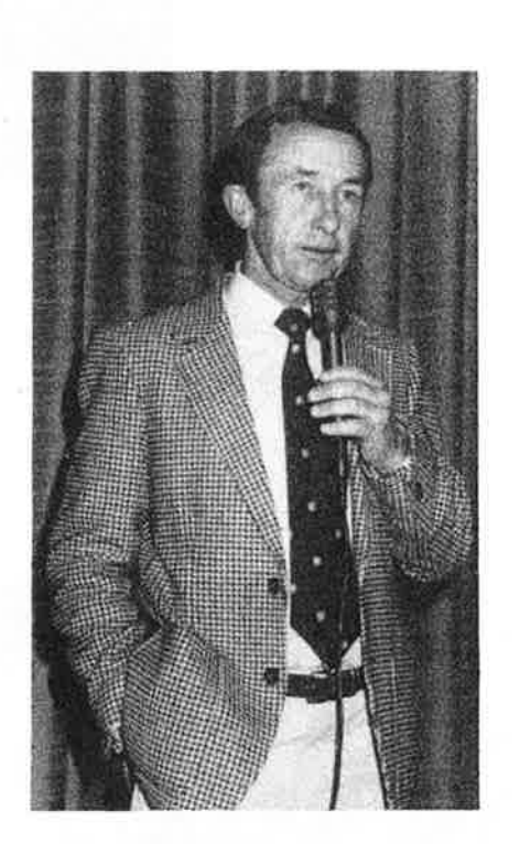
Words fail me!