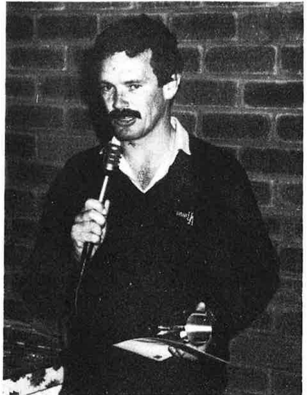
And now something from the hit parade!