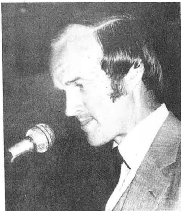
A response from the Pres!