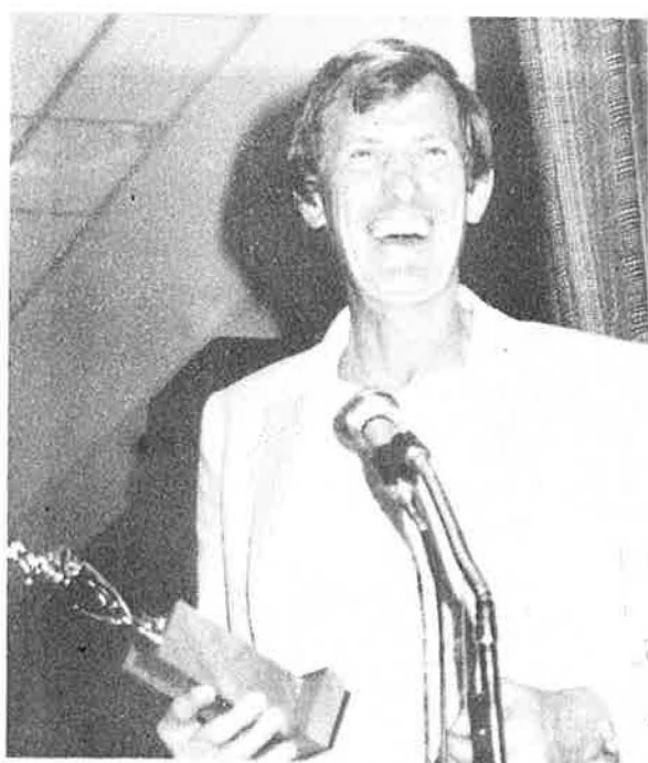
24 Um's 36 Er's