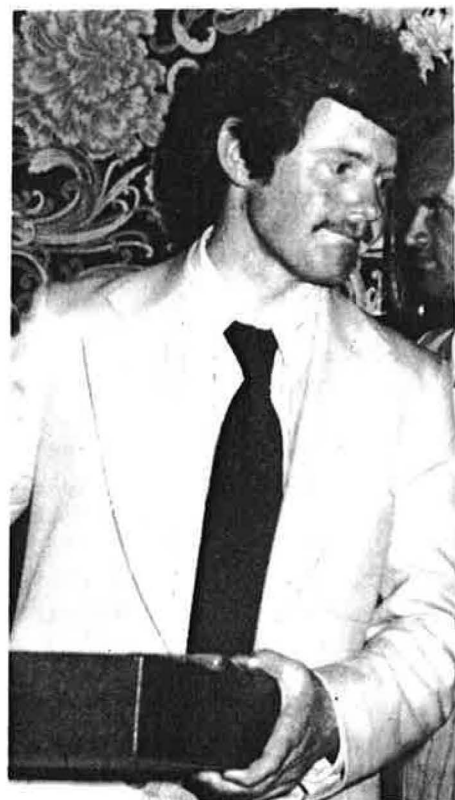
Goal Umpire/ Impersonator extraordinaire!