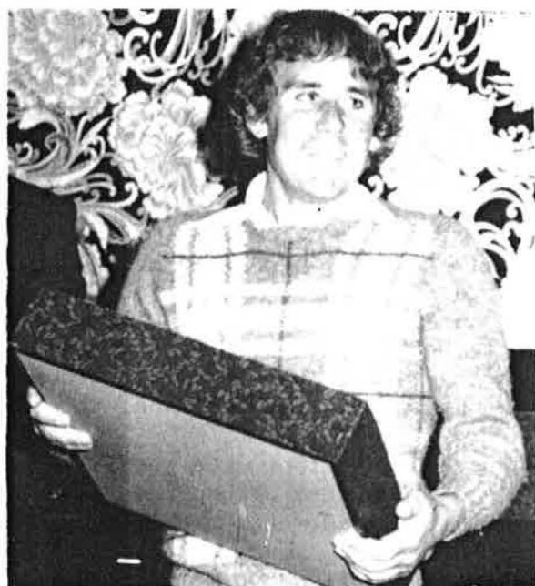
His dentist is proud of him !